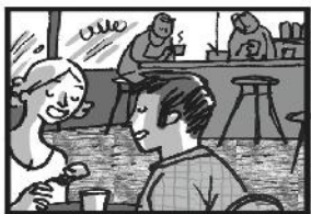
9 Katherine and Steven usually _____.