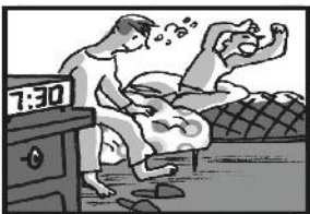
7 Mark and Nick usually _____.