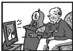
Today, John _____.