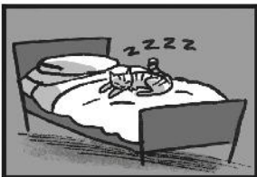
10 The cat usually _____.