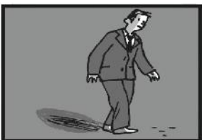
8 Rob usually _____.